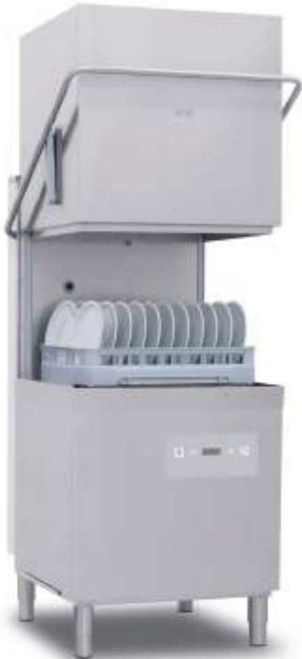
Hood Type Dishwasher (50x60) 60 racks/hour