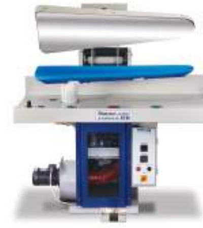
Utility Laundry Press