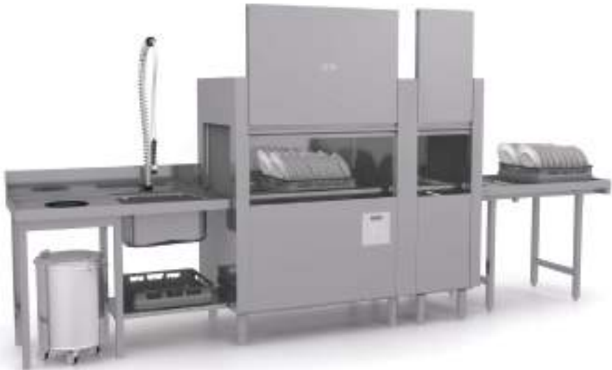
Ultra Rinse 200 racks/hour