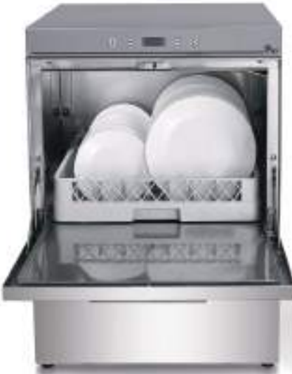
Undercounter Dishwasher 50 racks/hour