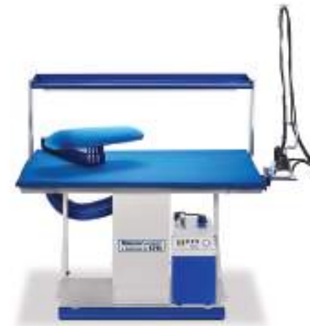
Vaccum Ironing Table

Also available in Steam Press and Built in Boiler