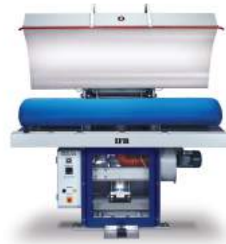
Flat Bed Press