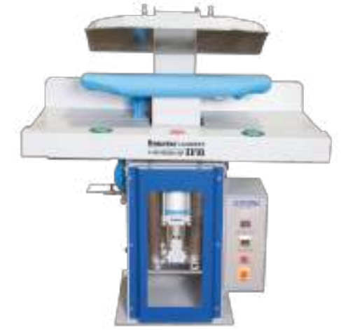
Body Bossom Press

Also available in Steam Press and Built in Boiler