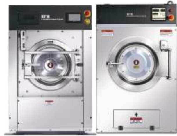
11Kg Washer and 11Kg Dryer