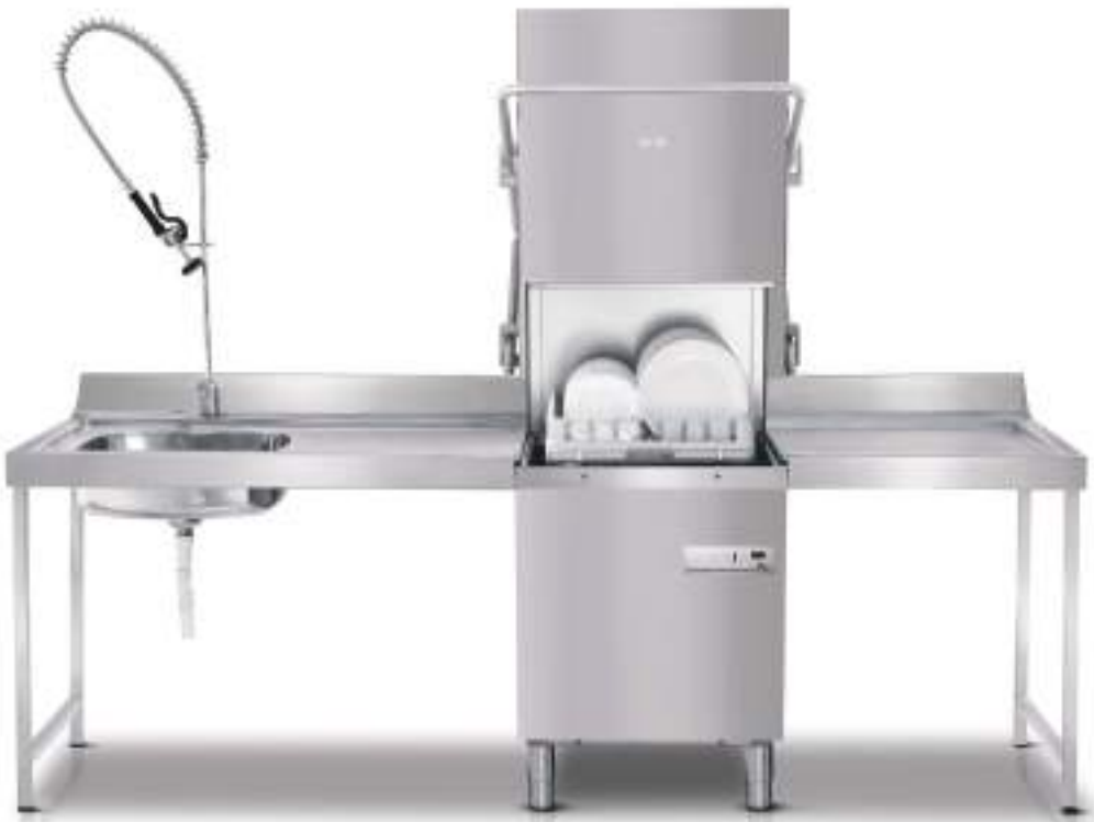
Hood Type Dishwasher 50 racks/hour