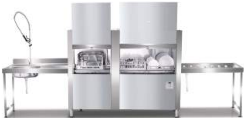
Rack Conveyor Dishwasher 200 racks/hour with pre-wash chamber