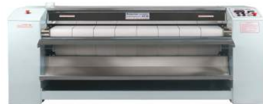
Flat Work Ironer