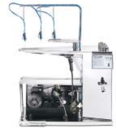
Stain Removing Machine

Semi-automatic steam press (Available in different models)