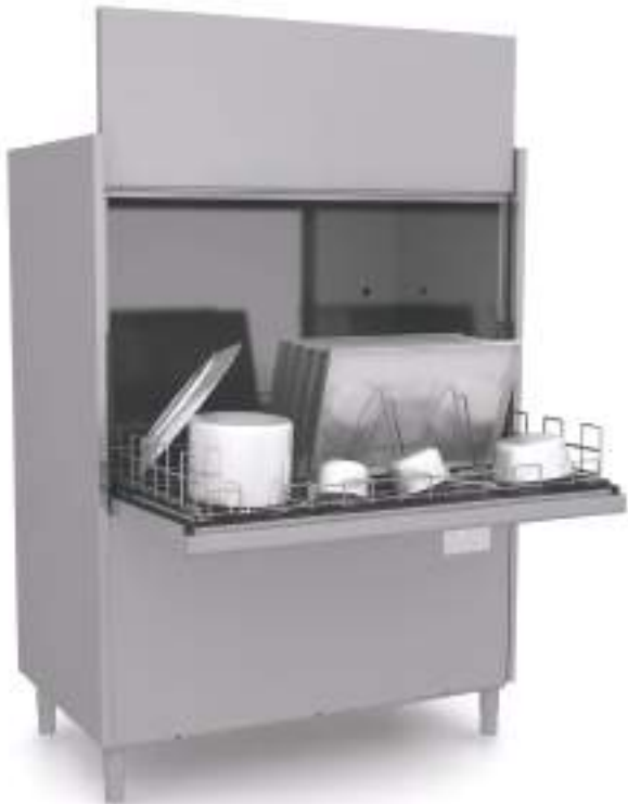
Utensil & Pot Washer D.7 30 racks/hour