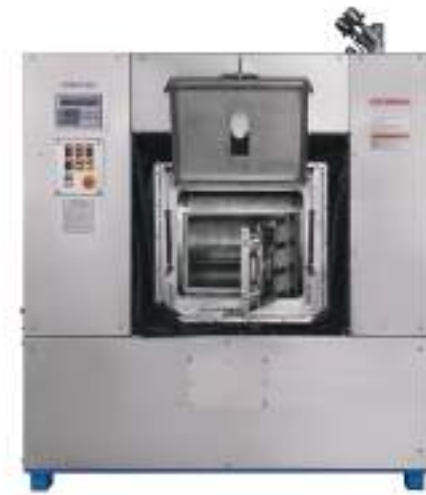
Hygienic Barrier Washer Extractor

Capacity—15 Kg, 30 Kg, 60 Kg, 75 Kg, 120 Kg, 150 Kg, 200 Kg, 300 Kg