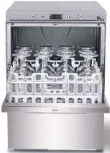
Undercounter Glasswasher 30 racks/hour